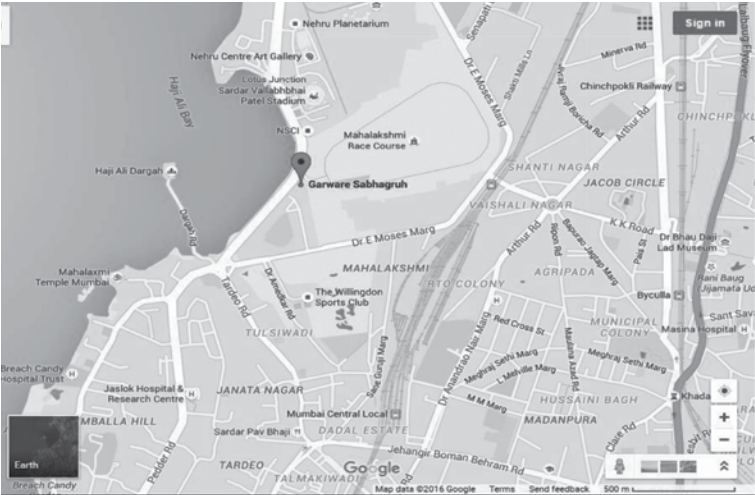
Landmark - Hajiali